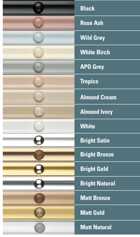
Special colours available on request.