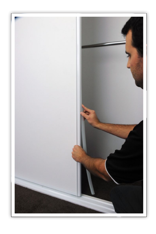
Step 7: Insert the buffer strip

Above each wheel is a screw which allows the doors to be adjusted (up and down). Use a screw gun or screwdriver to adjust the doors so that the edge of each door is flush with the door jambs.