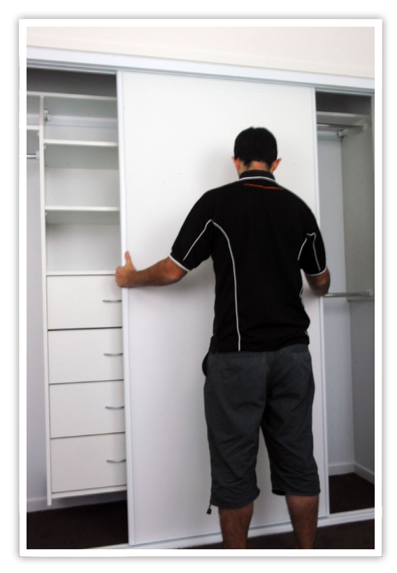
2. Sit the door in place onto bottom track

Lean the doors forward and lift the door so that the top of the door slides into the top track. Once the top of the door is in place, sit the bottom of the door onto the bottom track. The wheels should sit in the v-groove.