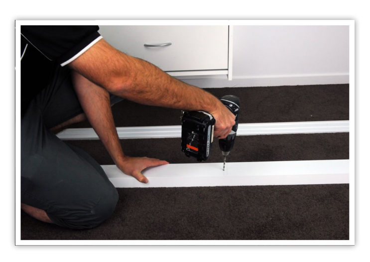
Step 3: Fix the top track in place

Place the star caps on the screws. Using a hammer, lightly tap on the star caps so that they are fixed in place.