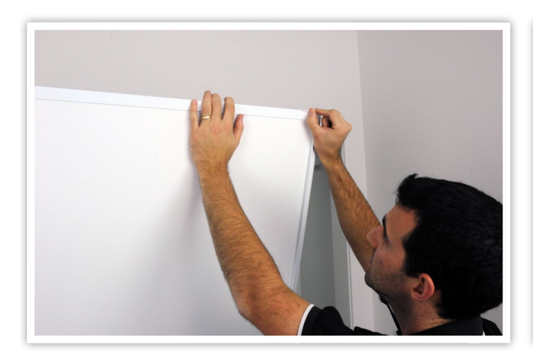
Step 4: Adjust the door guides