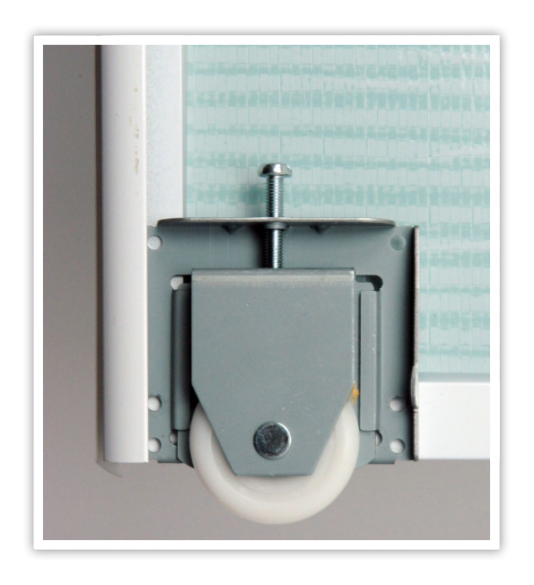
Step 6: Adjust the doors