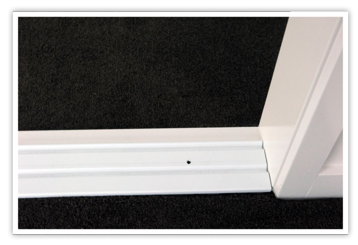
Step 1: Fix the bottom track in place