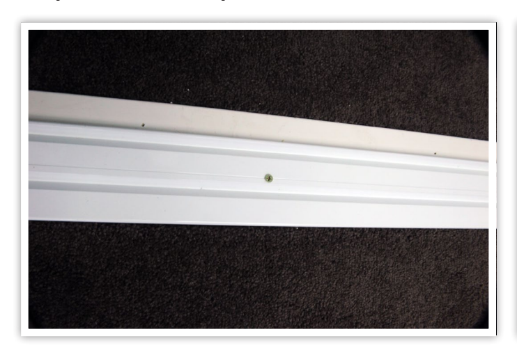
Step 2: Put star caps on screws

Place the bottom track in place (as shown in the above images). Fix the bottom track in place with screws or liquid nails. If using screws, pre-drill 3 holes along the track and then fix the track in place.